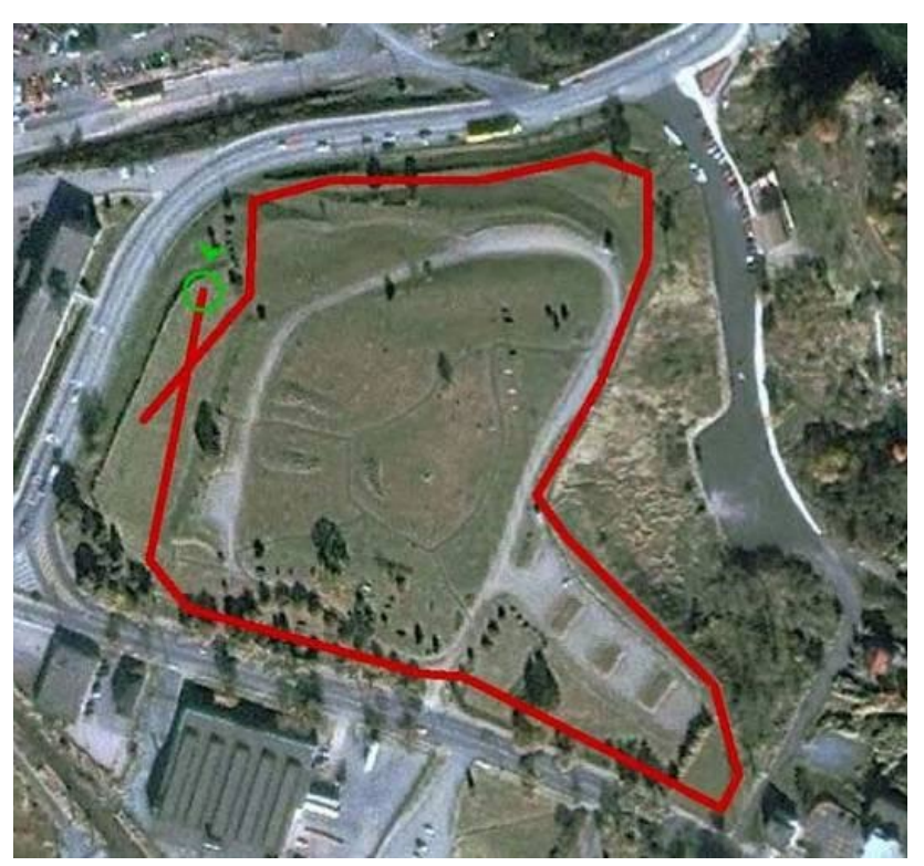
1.1 km Loop